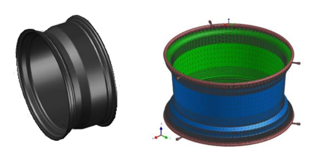
Fig. 2. Numerical analysis for VARTM of carbon composite wheel.